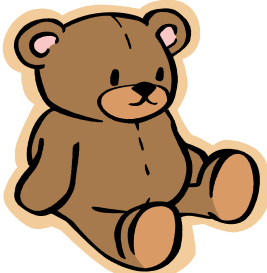
Vine Hill Bears