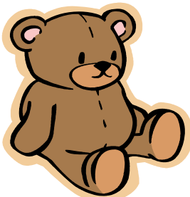
Vine Hill Bears