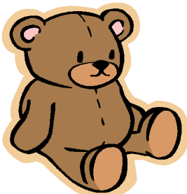
Vine Hill Bears

Total Number of Students Enrolled in 2007-08 - 587